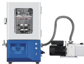
Automatic lifting shelves without manual operation