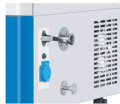
Vacuum pump port, convenient for oil change