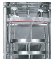
The design of glass door ensures the working situation in the drying chamber visible at a glance