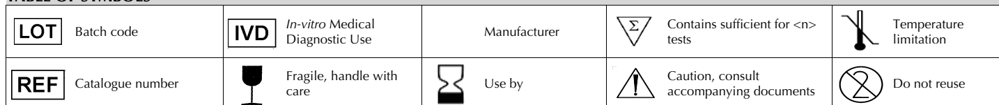
TABLE OF SYMBOLS

One vial of Supplement is sufficient to prepare 500 ml of medium.