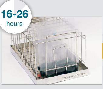
Samples are incubated overnight in a single, optimized enrichment medium at 34-38°C.

For visually confirmed selective enrichment of PIF, infant cereals, and related ingredients (with probiotics), Thermo Scientific<sup>™</sup> Oxoid<sup>™</sup> PrecisBlue Supplement is added to the diluted sample (alternatively, a novobiocin formulation can be used).