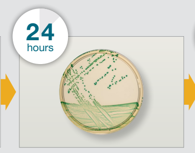
A single Brilliance CCI Agar plate is inoculated using a 10 µL loop, before incubating overnight.

Blue-green colonies are presumptive-positive for Cronobacter species.