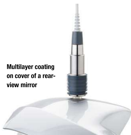
Multilayer coating on cover of a rear-view mirror

Additional comfort is added by the possibility to determine the sound velocity by means of reference samples. Once the sound velocity of a given material has been determined, it can be stored in the data base to be available for further measurements. This helps to cut the time expense for the set-up of your measuring tasks to a minimum.