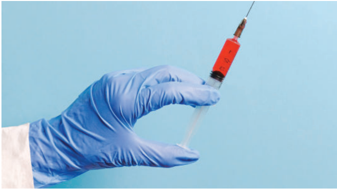
Vaccine & Pharmaceuticals