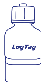
Buffer assembly Not Included (Silica sand recommended for temperatures below -40°C)