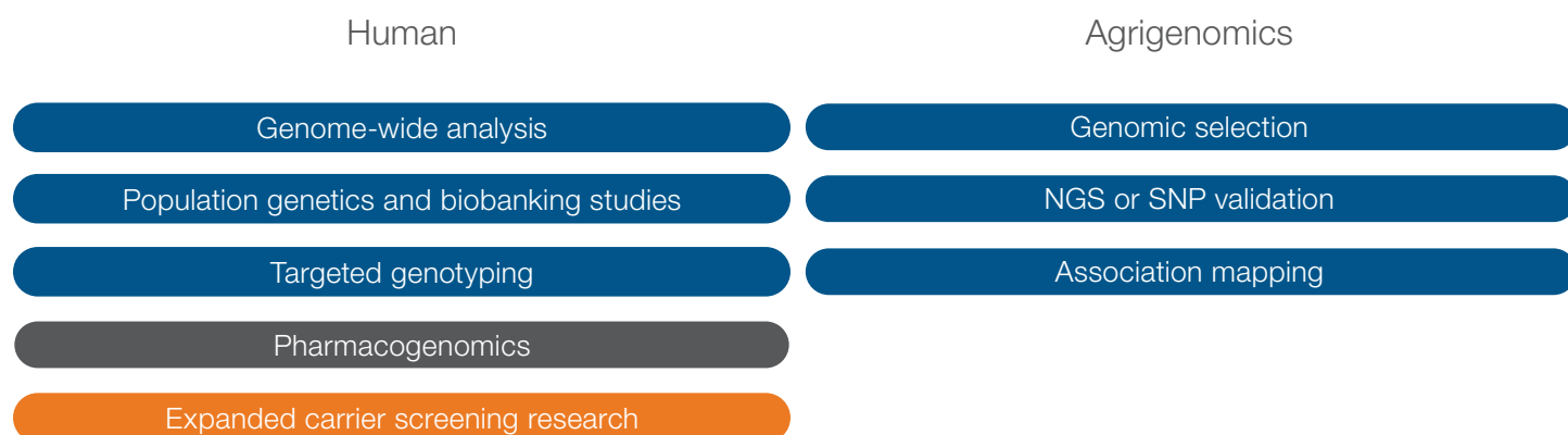
Figure 2. Broad range of applications. The GeneTitan MC Fast Scan Instrument, together with Applied Biosystems array plates, enables a wide menu of applications in genetic variation studies. Blue: genotyping; gray: pharmacogenomics; and orange: reproductive genomics.