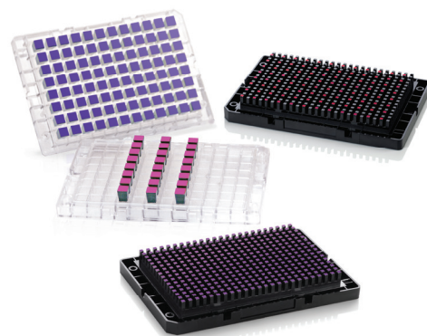
Figure 1. Multiple array plate formats. Predesigned and customizable array plates, shown in 24-, 96-, mini-96, and 384-array formats, give you the highest productivity with a scalable throughput.

The GeneTitan MC Fast Scan Instrument, together with Applied Biosystems™ high-throughput (HT) array plates, provides an automated solution for microarray processing. With a broad selection of array plate formats (Figure 1), you can easily transition from discoveries through genome-wide single-nucleotide polymorphism (SNP) genotyping to comprehensive explorations of biological phenotypes for disease or drug response (Figure 2).