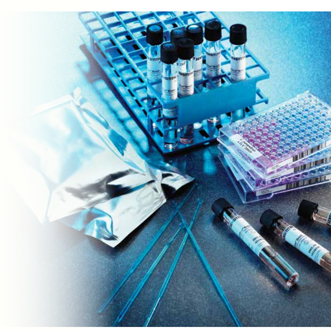
The Sensititre System is the only system that utilizes true MIC results, crucial in the fight against antimicrobial resistance.