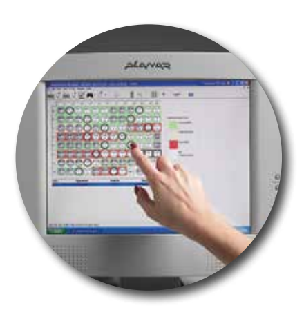
Touch screen navigation puts results at your fingertips!