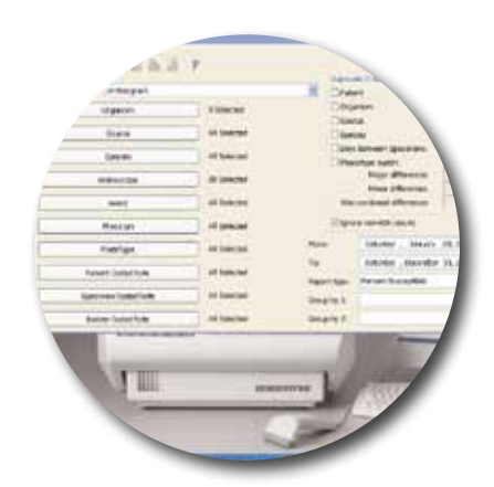
The SWIN Epidemiology Module is the ultimate tool for comprehensive reporting, with five customizable report options.