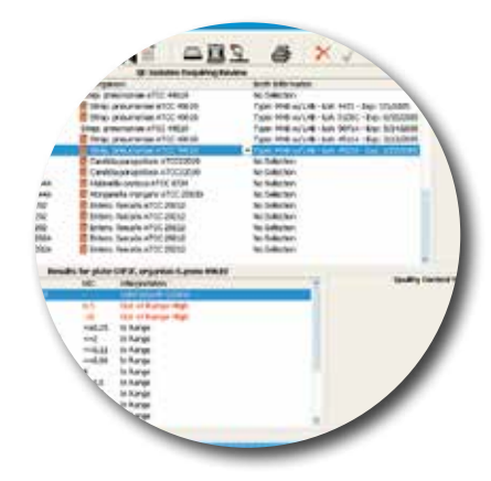
Drop down fields eliminate difficult codes and numbers, eliminating manual entry errors.