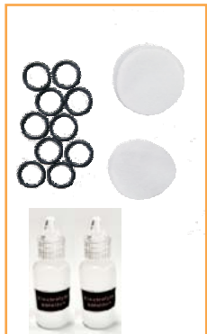
MEMBRANE+ELECTROLYTE PACK P/N:VZ840AAZ Replacement membrane & o-ring, 10 pieces /pack Two vials (25mL) refill electrolyte