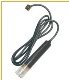
D.O. REPLACEMENT PROBE P/N:VZ840PAZ Size:18.5~23(d) x 140mm(l) Cable length : 3.5 meters with mic connector