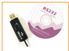
USB CABLE & SOFTWARE P/N: VZUSBAZM