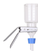
ROCKER, 300 mL VF 6, Glass Filter Holder (167120-31)

* MB adaptors are compatible with Pall, Sentino® disposable funnels (4870 / 4871).